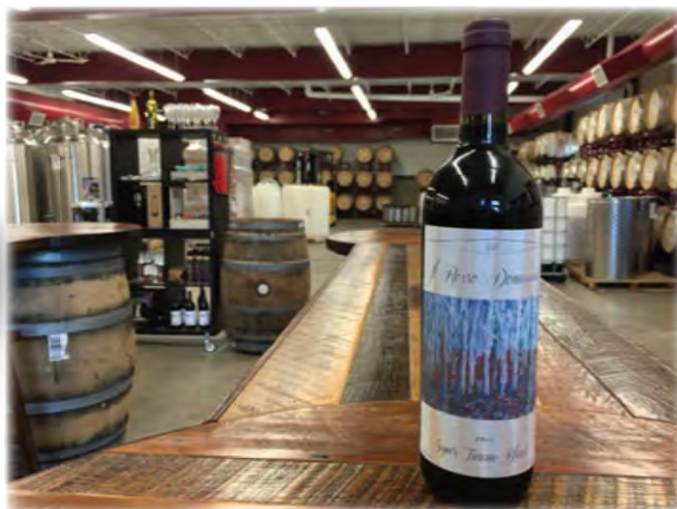
Custom label by our in-house designer for a customer's wine

Give your best customers a fine bottle of wine from Stone & Key Cellars, decorated with a custom label featuring the logo of your business! Also great for weddings, parties, and other special events. See coupon on facing page.