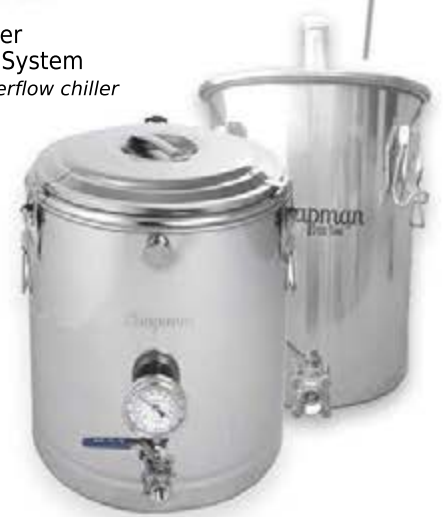
Stainless Steel Fermenter 7 gallon capacity $149.95