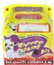
Cheese Making Kits Starting at $29.95