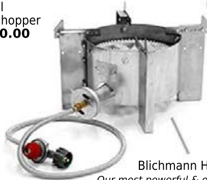
Blichmann Hellfire Our most powerful & efficient burner! 120,000BTU $149.99