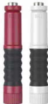
Host Air Pop Wine Bottle Openers $26.50