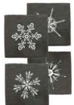
Slate Coasters $14.50