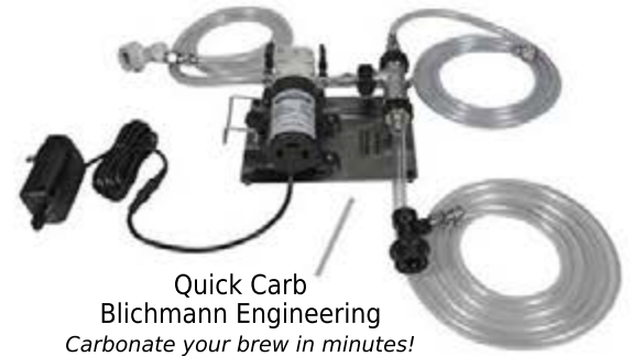
Quick Carb Blichmann Engineering Carbonate your brew in minutes! $179.99