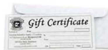
Gift Certificate The perfect gift for any homebrewer, winemaker, or fermentation enthusiast! Any Dollar Amount