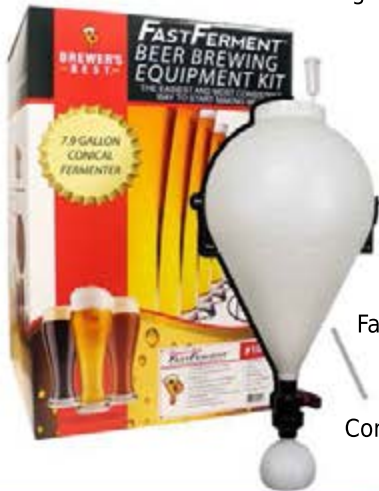
FastFerment Conical Fermenter The ultimate in fermentation convenience & functionality! $99.99 Complete FastFerment Starter Kit $169.99