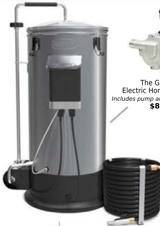
The Grainfather Electric Homebrew System Includes pump and counterflow chiller $890.00