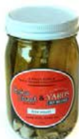
Brine Street Pickles, Dressings, & More! Starting at $8.00