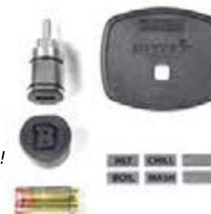
Brewvision Kettle Thermometer & Monitor Sends real-time alerts & data logs to your smartphone! $99.99