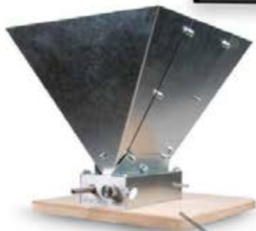
Monster Mill 2 or 3 rollers with hopper Starting at $210.00