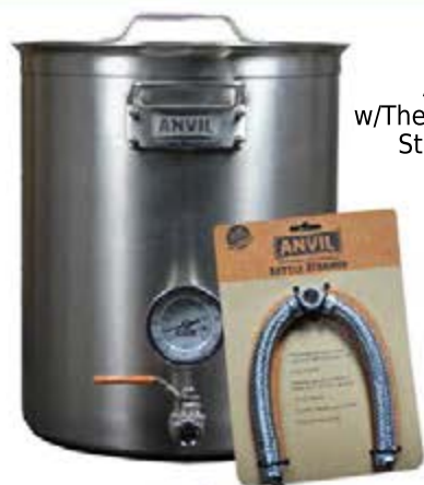
Anvil Brew Kettles w/Thermometers and Spigots Starting At $149.99