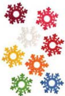
Snowdrift Wine Charms $10.50