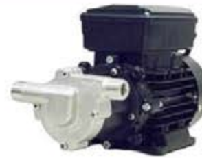
MiniMax Chugger Pumps High-Temp Tolerant $198.50