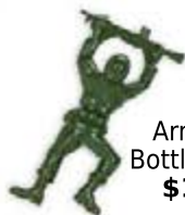
Army Man Bottle Opener $10.95