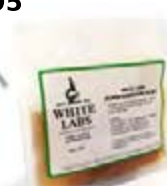
Kombucha Scoby $39.95