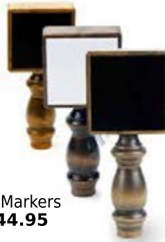
Tap Markers $44.95