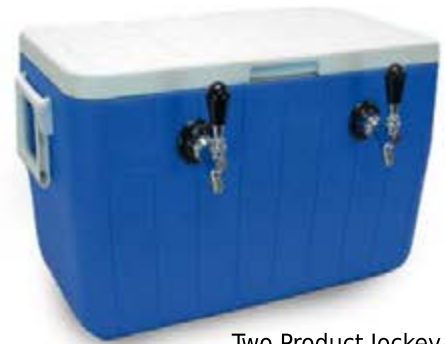
Two Product Jockey Box $399.95