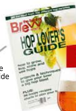
BYO Magazine Hop Lovers Guide $6.99