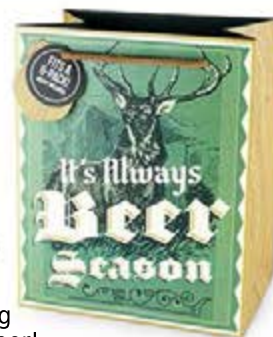
6-Pack Gift Bag For The Gift of Beer! $4.25