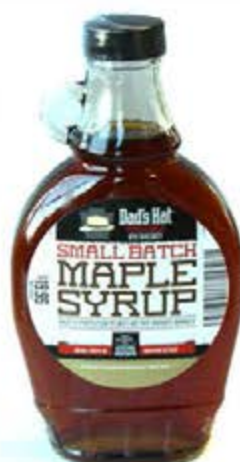
Dad's Hat Whiskey Barrel Aged Maple Syrup $19.95