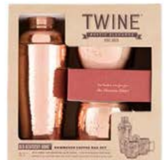
Hammered Copper Bar Set $79.95