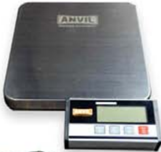
ANVIL High Capacity Scale $69.99