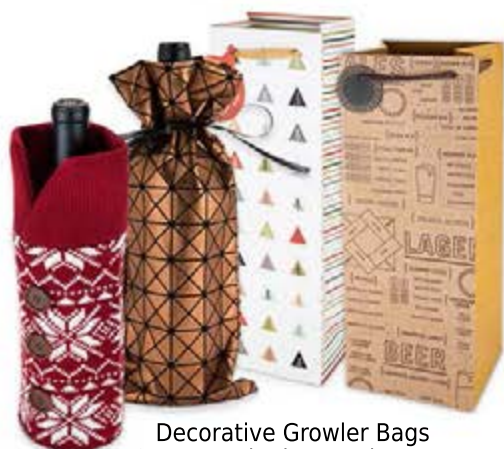
Decorative Growler Bags & Assorted Wine Bottle Totes Starting at $2.75