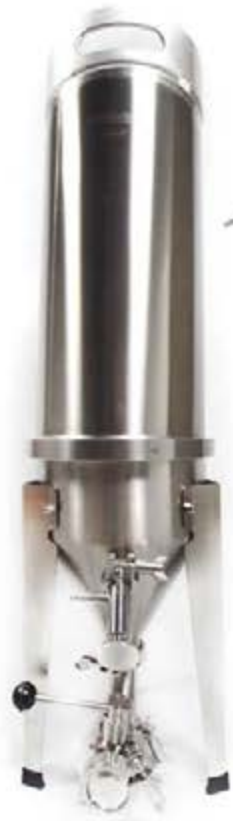
The Cornical® Blichmann Engineering Keg + Conical Fermenter in one marvelous modular vessel! $499.99