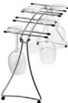
Eight-Glass Stemware Dryer $19.95