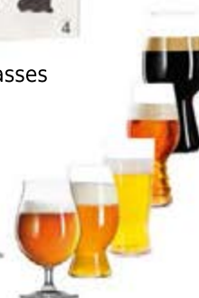
Speigelaug Glassware Starting at $32.95