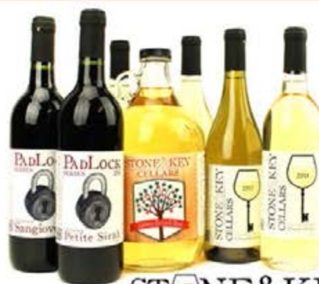
STONE & KEY CELLARS