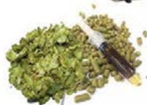
Anvil Brew Kettle Dual Strainer Upgrade $44.99