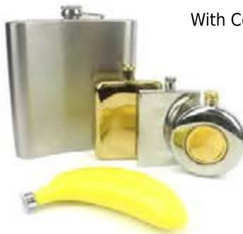
Assorted Flasks A vast array of shapes, sizes, and styles! Starting at $14.50