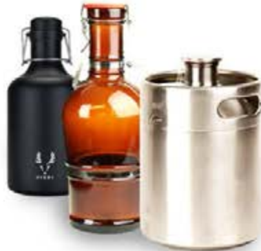
Assorted Growlers Draught beer on the go, in style! Starting at $16.49