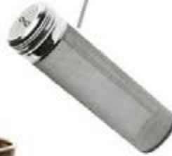
Corny Keg Dry Hopper 11.8in & 18in $64.95 & $81.95