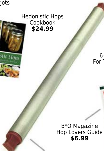
Carboy Dry Hopper Mesh Tube $29.95