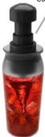
Cocktail Spinner $19.95