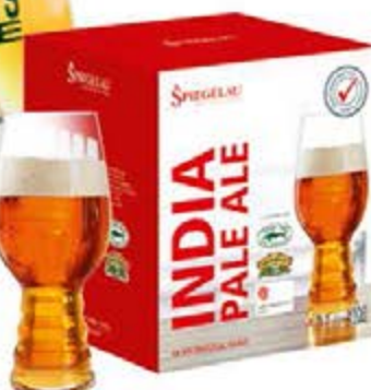
Spieglelau IPA Glasses (4pk) $54.95