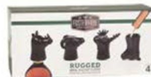
Animal Shot Glasses $18.98